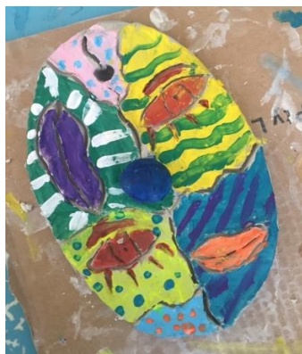
Picasso Mask (clay)