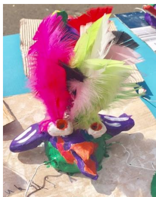
Wild Birds (clay)