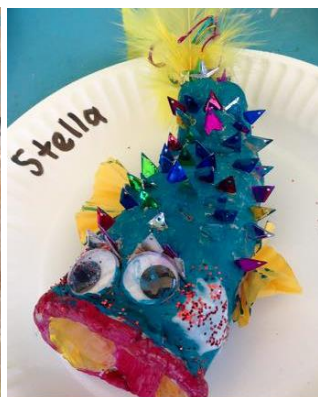
Crazy Fish (clay)